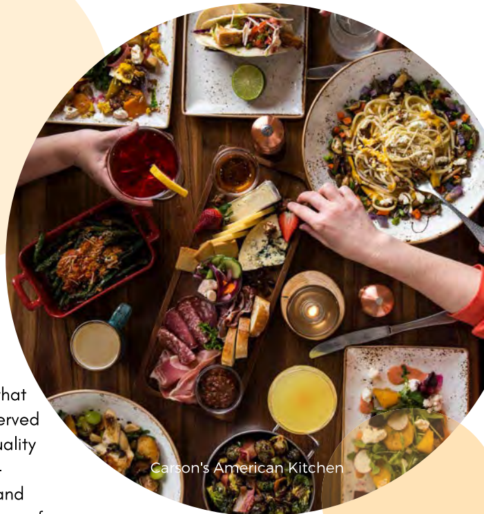
Carson's American Kitchen

Carson's American Kitchen is a lively fine dining restaurant in Sunriver Resort that offers a menu that would satisfy anyone. The Pacific Northwest-style fare is served for breakfast, lunch and dinner. It's a favorite destination in the area for its quality dishes and friendly staff. Entrees highlight the regional bounty, including pan-seared rainbow trout, juniper berry-crusted venison, high desert beef burger and more. Start your meal with drinks, stay for dessert and enjoy the expansive views of the Deschutes National Forest and Cascades alongside your meal.