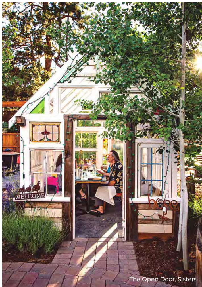
The Open Door, Sisters

As the weather heats up, the region’s alpine lakes do as well and become popular swimming holes. Back on Santiam Pass, Suttle Lake is popular with paddlers and swimmers. And just up the road from there, Scout Lake is a shallow spot with warm water that families swim in all summer long.