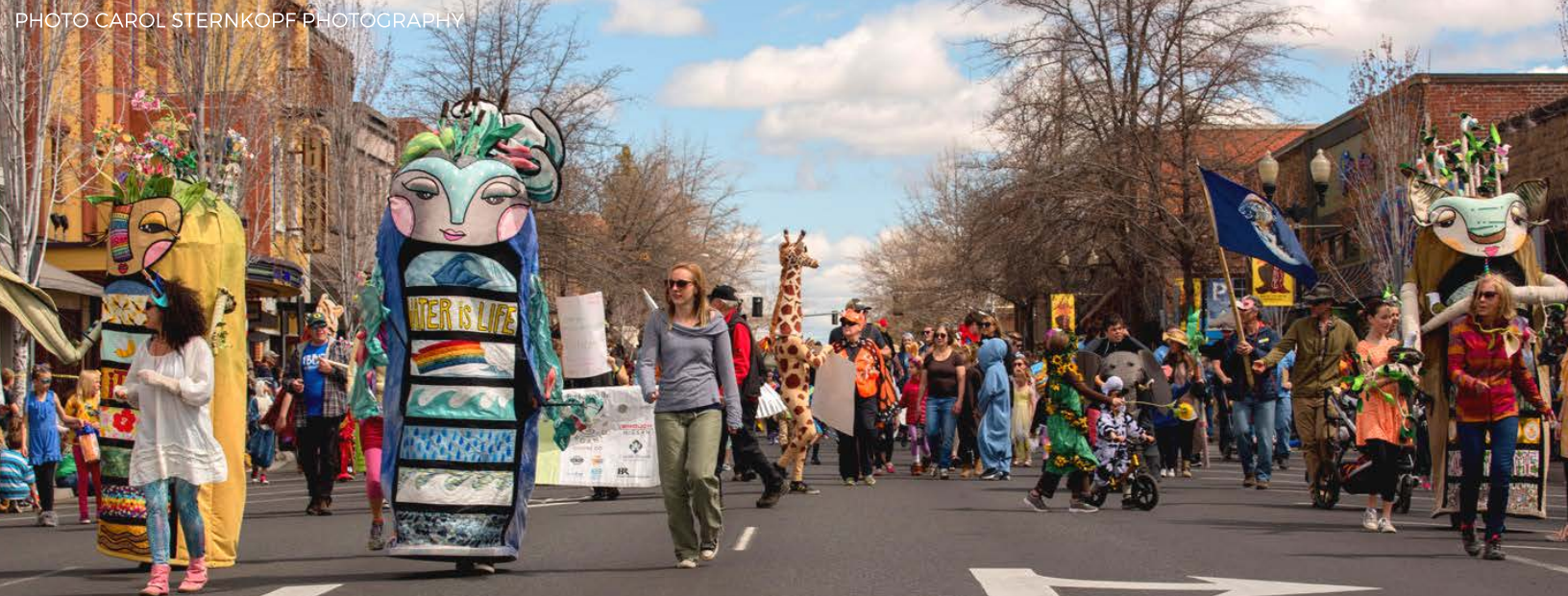
Earth Day Fair & Parade