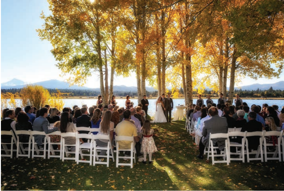
ASPEN CEREMONY SITE