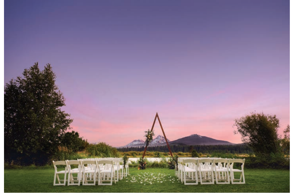
MOUNTAIN VIEW CEREMONY SITE

Imagine saying your vows alongside Phalarope Lake, with Broken Top, South Sister, North Sister, and Mount Washington behind you.