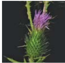
Bull Thistle