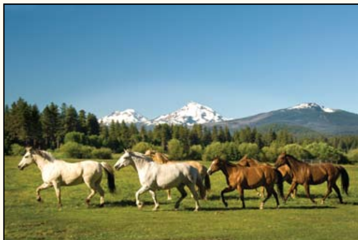
Horses on their way to work... Make summer memories with a trail ride this year.

The switch to emailing the Ranch Report will require homeowners to have an email address registered in our database in order to receive it. To register your email address, go the property owner's page on the website at BlackButteRanch.com/property-owners and click on the light blue link that says "to sign up or update your email preferences click here." The newsletter will also be available on the owner's webpage. September – October will be the first paperless version.