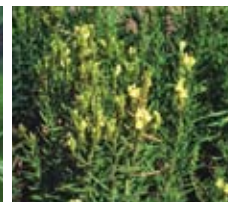
Yellow Toadflax