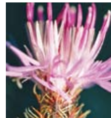
Diffuse Knapweed