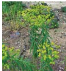
Leafy Spurge