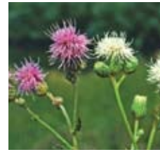
Canada Thistle