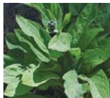
Common Houndstongue co.Stevens.Wa.us