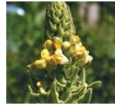
Common Mullein