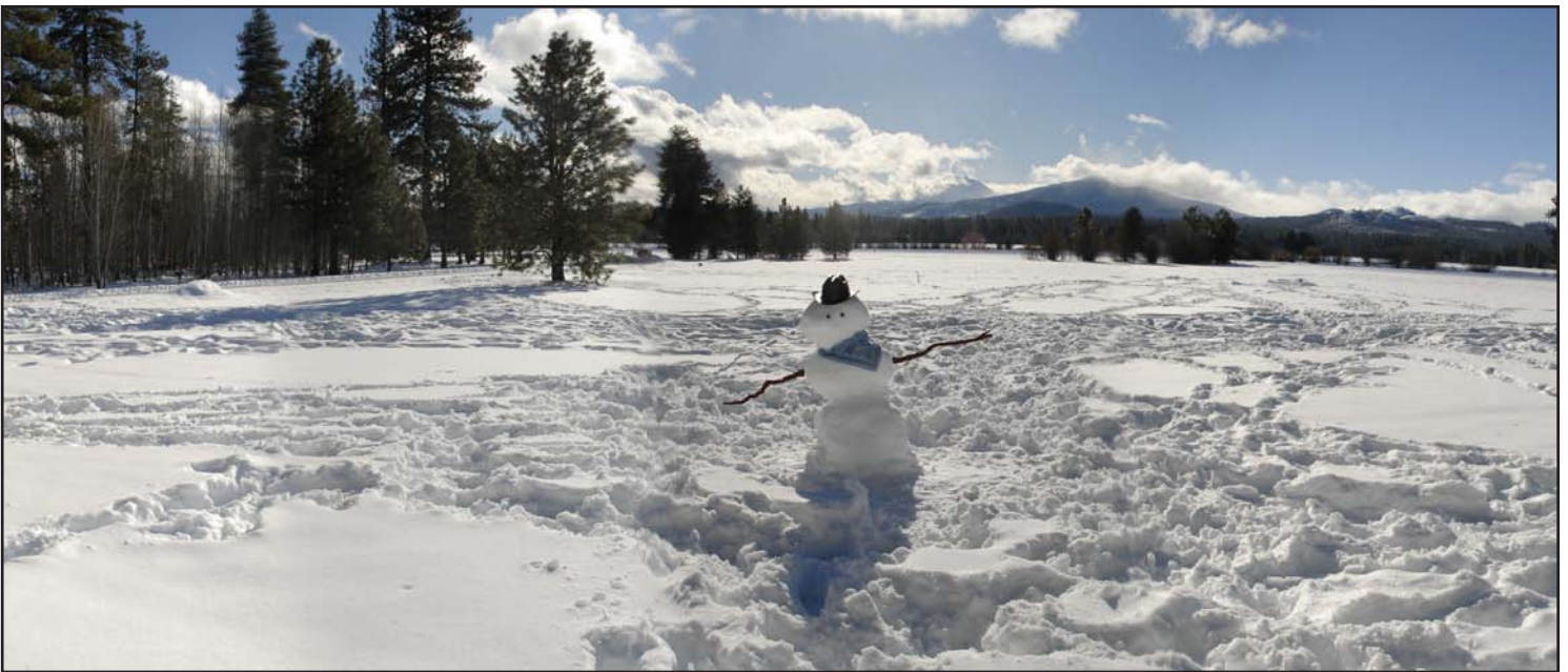
Create your own winter memories at the Ranch...

So, whether you want to enjoy the tranquility of the Ranch or enjoy all the activity winter offers—there is a place for you.