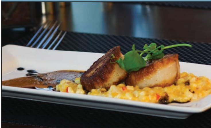
Scallops at the Lodge Restaurant