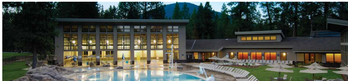
The Glaze Meadow Recreation Center includes pools, hot tub, steam room, Spa, Sports Shop, fitness rooms and snack shop. The Tennis building is located across the parking lot next to the courts.

Tournament headquarters is at the Tennis Office at the Glaze Meadow Recreation Center at Black Butte Ranch. Please check in at tournament headquarters at the Glaze Meadow Recreation Center Tennis Office 15 minutes in advance of your scheduled match time.