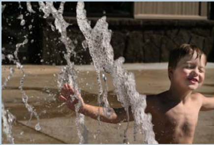
Indoor Pool 7am– 9pm

Adult lap swim begins at 7am and goes until 10am and then starts up again at 5pm and ends at 6pm. Individuals ages 18 and older are more than welcome to swim then. All other open hours are free swim.